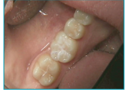
Sealant hardens quickly