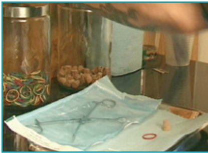
An invasive surgical procedure

Some people who consider tongue or lip piercing may not be aware of all the risks involved. Though the procedure is fairly simple and is normally performed without anesthetic, the consequences can be severe.