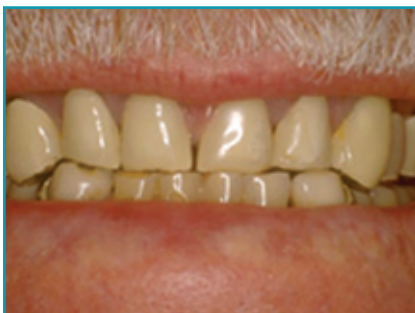
Worn teeth due to bruxism