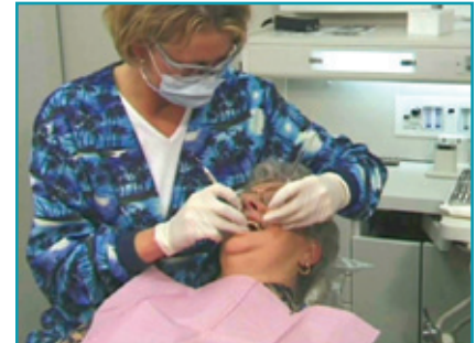
Regular cleanings can help